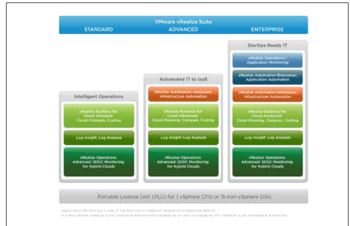
Figure 2: vRealize Suite Editions

For more information about the components included in each vRealize Suite edition, visit the vRealize Suite Compare Edition web page .