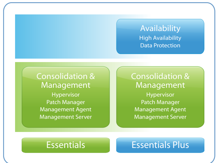
VMware vSphere Essentials editions

Both editions are all-inclusive packages that enable you to virtualize and consolidate many application workloads onto three physical servers (up to two processors each) running vSphere and centrally manage them with vCenter Server for Essentials. vSphere Essentials includes a one year license subscription. Support is optional and available on a per incident basis. vSphere Essentials Plus has several Support and Subscription (SnS) offerings that are sold separately. A minimum of one year of SnS is required.